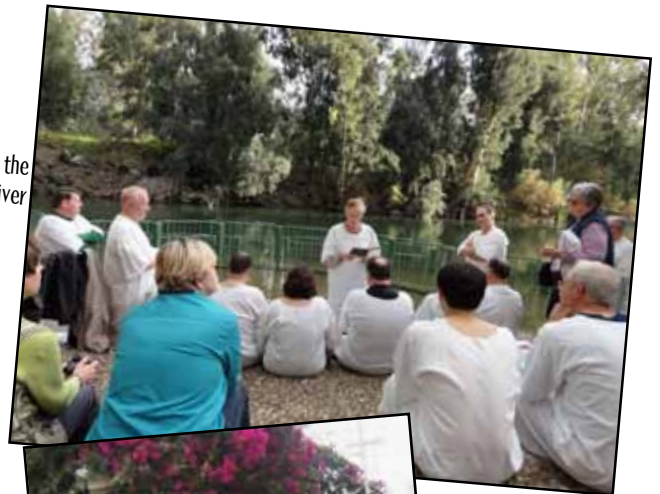
Baptizing in the Jordan River