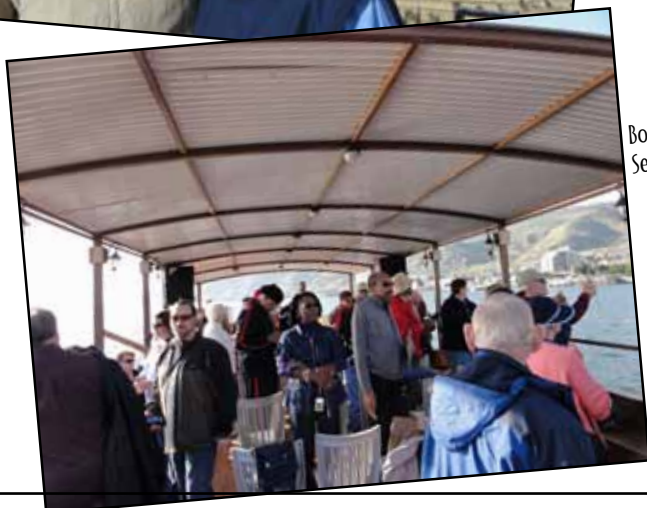
Boat ride on Sea of Galilee