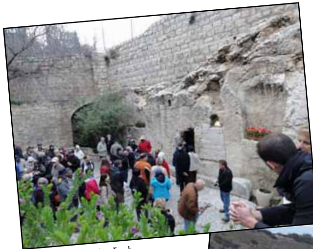
The Garden Tomb

I am grateful that God trusted us with this assignment. To see the pastors and laymen have such a great time was a real blessing!