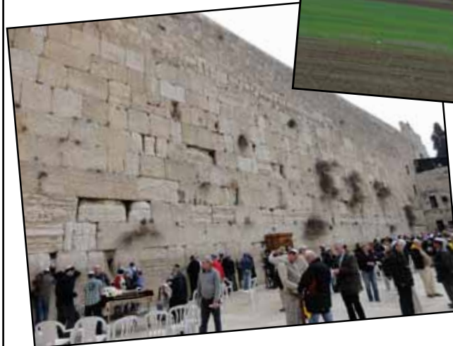
The Wailing Wall

Check out our website: www.shepherdsfoldministries.org Notice our links: Day of Renewal Registration and Books