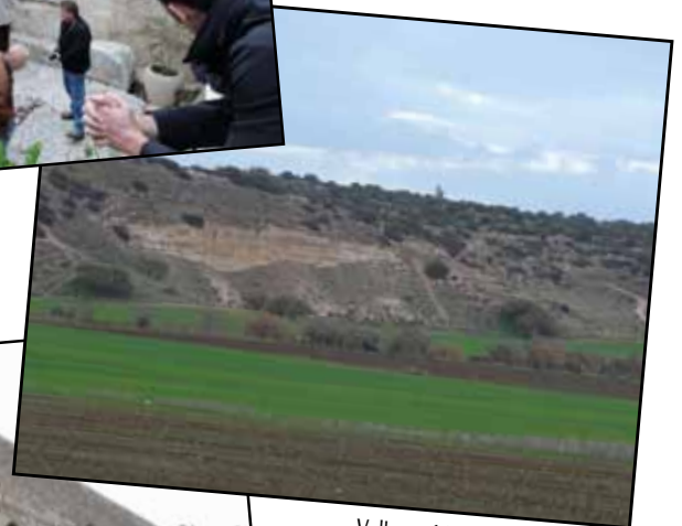
Valley of Megiddo